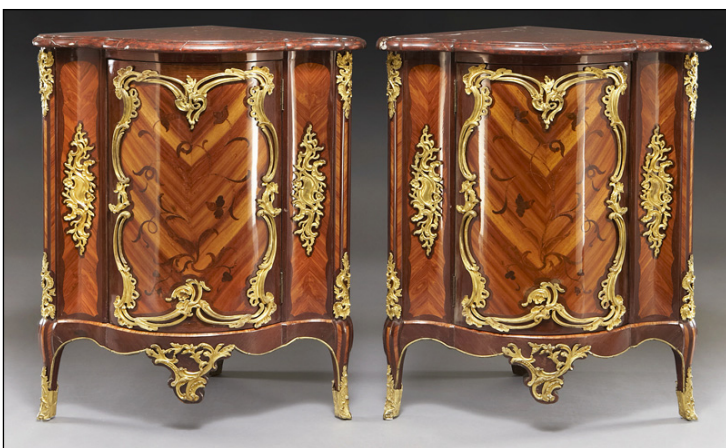
Pair of Pierre IV Migeon tulipwood corner cabinets, one stamped, "Migeon," both stamped "JME" with mark of the Duke of Penthièvre ($175/225,000).

DALLAS, TEXAS — Dallas Auction Gallery will kick off the spring with an antiques and fine art auction on April 25 at 6 pm. The sale will feature signed French furniture and Twentieth Century fine art from a local Dallas collection, including a pair of Pierre IV Migeon tulipwood corner cabinets ($175/225,000) and a piece by Carlos Cruz-Diez ($150/250,000).