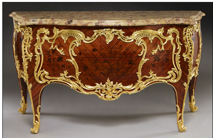
Attributed to Pierre IV Migeon (French, 1696–1758), Louis XV commode of rosewood, satinwood and palisander ($100/150,000).